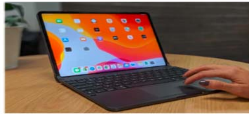
Bilby 12.9 TP (Code Name)