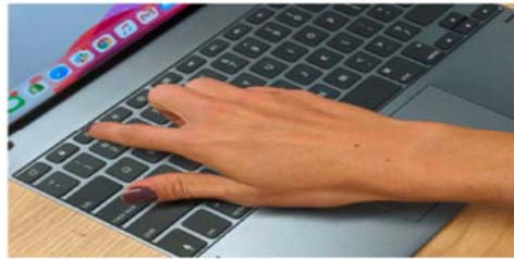
Bilby 12.9 TP (Code Name)