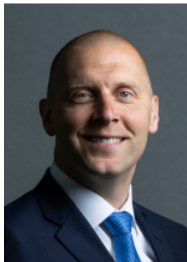
MARK POPE Head Coach (2nd Season)