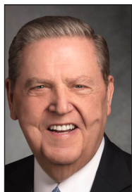
Elder Jeffrey R. Holland of the Quorum of the Twelve Apostles was excused from general conference due to COVID-19.